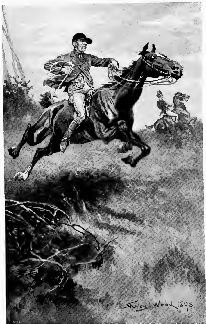
"He jumped it again." (Page 200.)